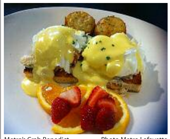
Metro's Crab Benedict