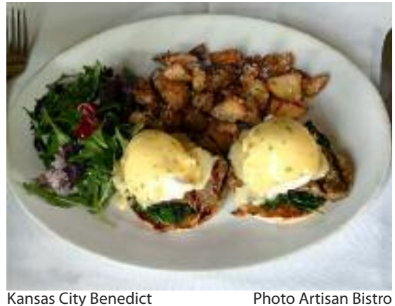
Kansas City Benedict

Too many choices have you looking for a prix fixe option? Check out the three-part prix fixe brunch menu at Lafayette's Metro, urban sophistication in a suburban setting. Select a starter of apple fritters with crème anglaise or Strauss organic yogurt topped with Café Fanny's granola, choose a main dish of Croque Madame, Eggs Florentine or Metro Benedict, and pair your morning meal with a cocktail or refresher of choice. Savor your selec-